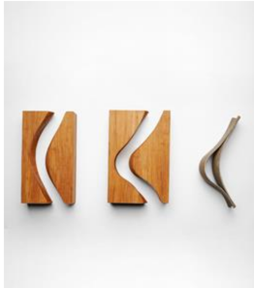
2. Investigating form