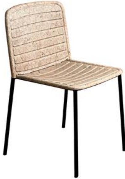
"Flax stacker" by Please Wait to be Seated