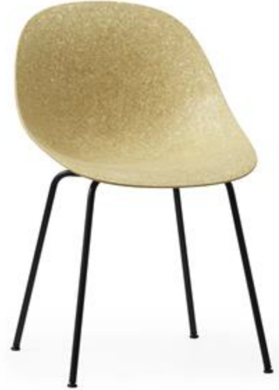
"Mat Chair" by Normann Copenhagen