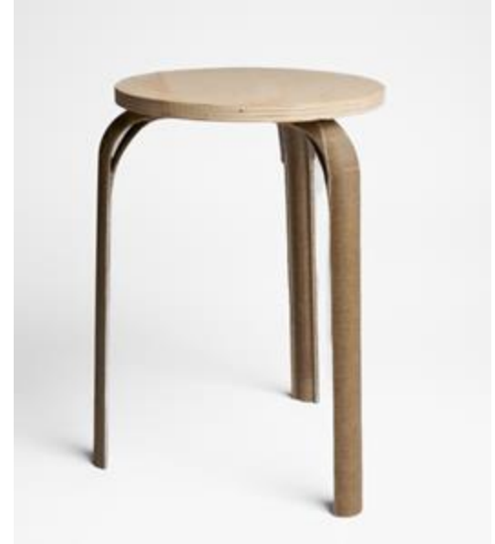
3. Investigating functionalities