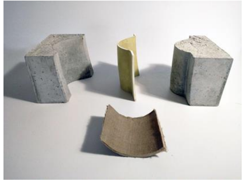
Form experiments with concrete molds