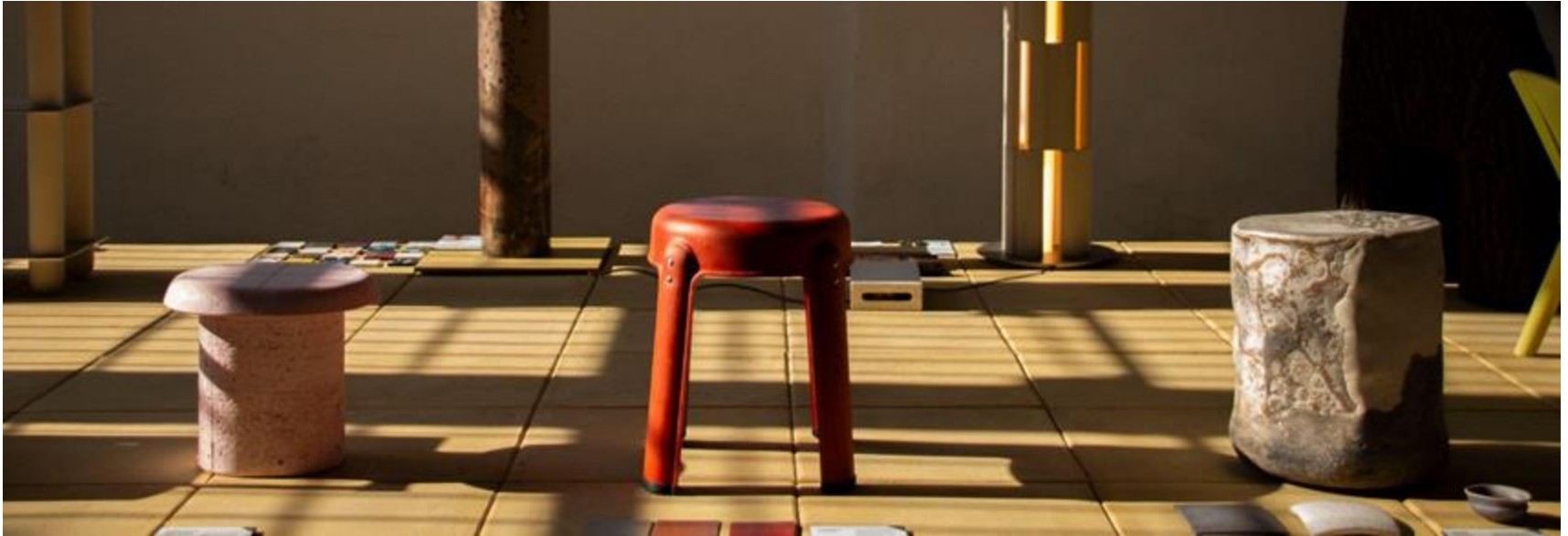
"Canopy" at Enhance , Milan Design Week